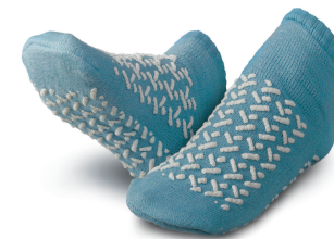
Standard double-tread slippers for most patients.