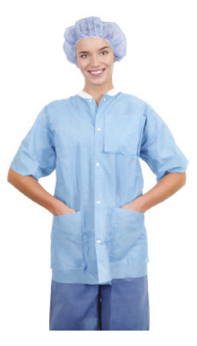
Essential short-sleeved range