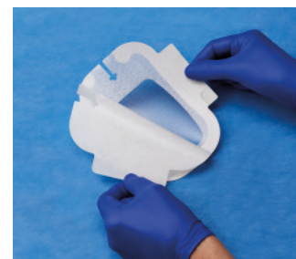
VAD1689-INT 10.2 x 15.5 cm