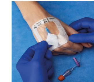
VAD1683-INT 7 x 7.3 cm