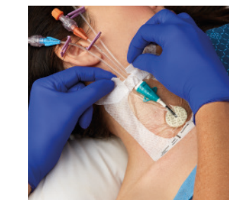
VAD1688-INT 10.2 x 11.4 cm