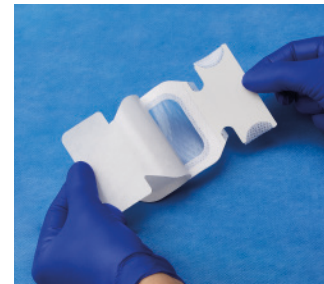
VAD1683-INT 7 x 7.3 cm