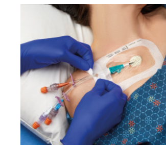
VAD1689-INT 10.2 x 15.5 cm