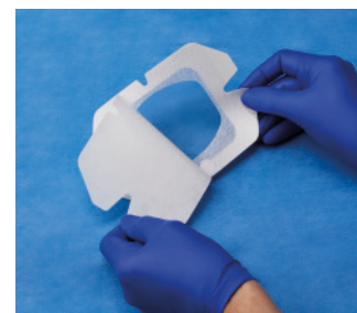
VAD1688-INT 10.2 x 11.4 cm