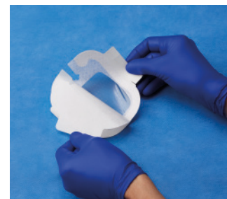
VAD1685-INT 8.9 x 11.4 cm