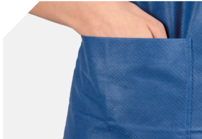
3 convenient pockets on the shirt