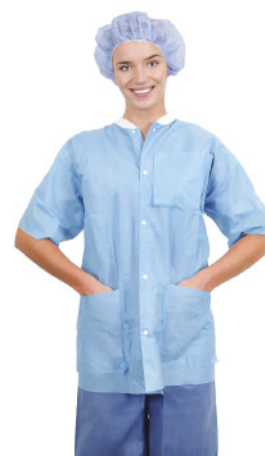
Essential short-sleeved range