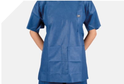
Bell-shaped design for a perfect fit

We have worked with healthcare professionals like you to create our scrub suits with features you want and need to perform at your best. Experience new, clean apparel every day.