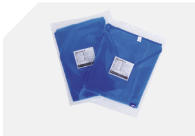
Shirt and pants packed separately