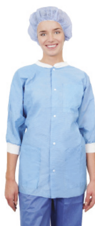
Essential three-quarter sleeve range