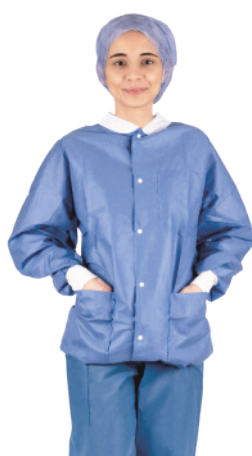
Soft long-sleeved Warm-Up Jacket range