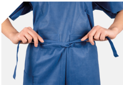
Adjustable waist ties