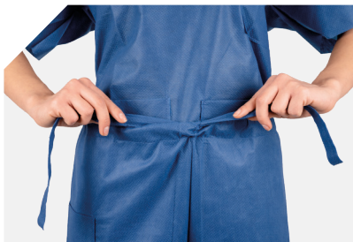
Adjustable waist ties