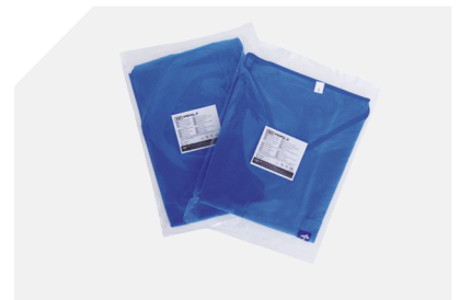
Shirt and pants packed separately