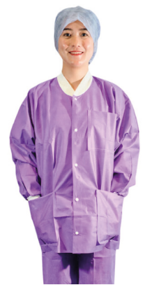
Soft long-sleeved Purple Warm-Up Jacket