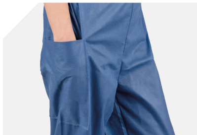
With single side pocket