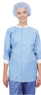
Essential three-quarter sleeve range