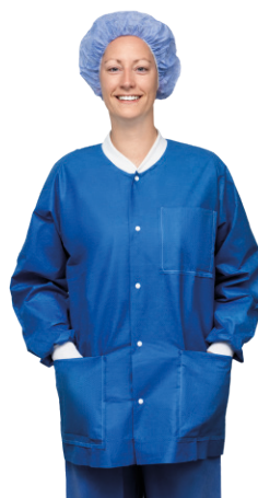
Ultimate long-sleeved warm-up jacket range