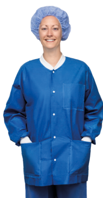
Ultimate long-sleeved Warm-Up Jacket range