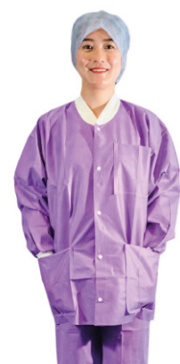
Soft long-sleeved Purple Warm-Up Jacket