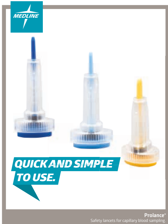
Prolance ® Safety lancets for capillary blood sampling.

Medline offers a great range of different products and services for you.