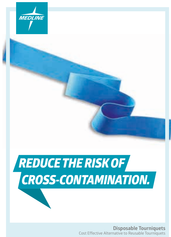
Disposable Tourniquets Cost Effective Alternative to Reusable Tourniquets

Tourniquets are medical devices in class I non sterile intended to be used by healthcare professionals. Before use, consult instructions and precautions on the corresponding labelling.