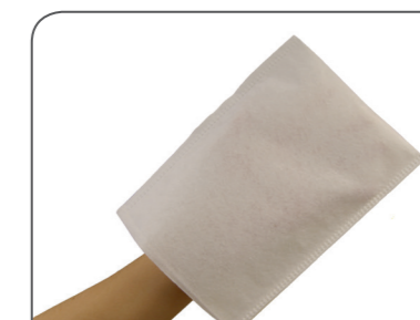
Dry wash gloves used with cosmetic products of choice.