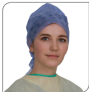
FS61750A for long hair