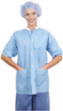
Essential short-sleeved range