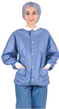
Soft long-sleeved jacket range

Medline's single-use Warm-Up Jacket range is designed with materials that ensure a high level of comfort while keeping your staff warm. Additionally, they feature an intuitive design with a gentle knit collar, cuffs or elastic wrists, and handy pockets.