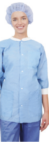
Essential three-quarter sleeve range