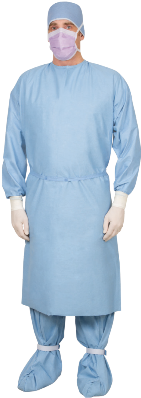
NONE27457: gown NONE27348PXL: boot covers

Complete protection is available in combination with the trilaminate polypropylene-polyethylene boot covers (NONE27348PXL).