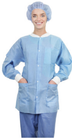
Essential long-sleeved jacket range