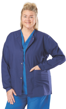
Reusable Warm-Up Jacket range

Medline's reusable and single-use Warm-Up Jacket ranges are designed with materials that ensure a high level of comfort while keeping your staff warm. Additionally, they feature an intuitive design with a gentle knit collar, cuffs or elastic wrists, and handy pockets.