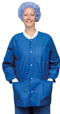
Ultimate long-sleeved warm-up jacket range