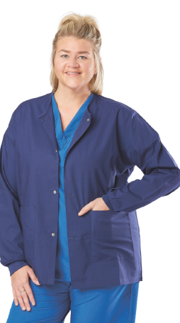
Reusable Warm-Up Jacket range

Medline’s reusable and single-use Warm-Up Jacket ranges are designed with materials that ensure a high level of comfort while keeping your staff warm. Additionally, they feature an intuitive design with a gentle knit collar, cuffs or elastic wrists, and handy pockets.