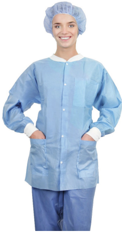
Essential long-sleeved Warm-Up Jacket range