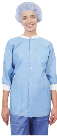
Essential three-quarter sleeve range