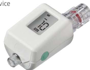
Compass Thoracentesis CTHR002-INT

For more information on this product, please contact your Medline account manager or visit our website: uk.medline.eu