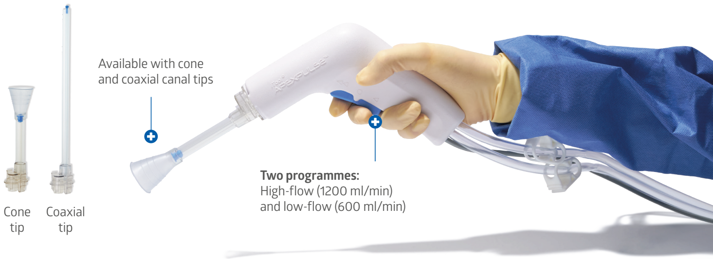
Cone tip Coaxial tip

Medline's pre-assembled Pulse Lavage System is a ready-to-use solution, designed for use in several applications, including orthopaedic, trauma surgery preparation and wound hydrotherapy.