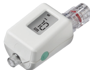
Compass Thoracentesis CTHR002-5

For more information on this product, please contact your Medline account manager or visit our website: www.medline.eu/uk